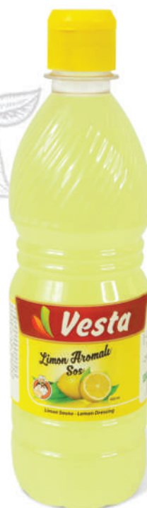
LEMON SOUCE (PLASTIC BOTTLE)