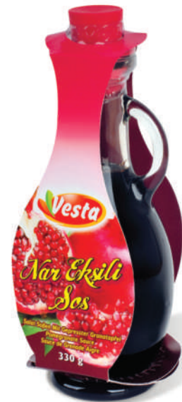
POMEGRANATE SAUCE (GLASS BOTTLE)