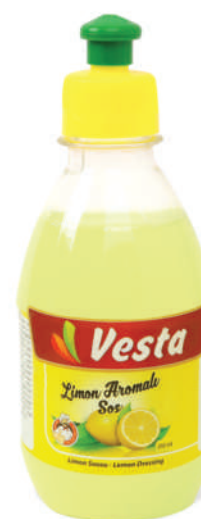
LEMON SOUCE (PLASTIC BOTTLE)