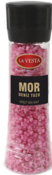
VIOLET SEA SALT