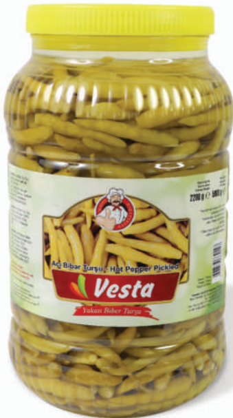
BURNING PEPPER PICKLED