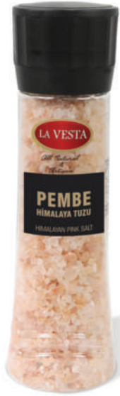
HIMALAYAN PINK SALT