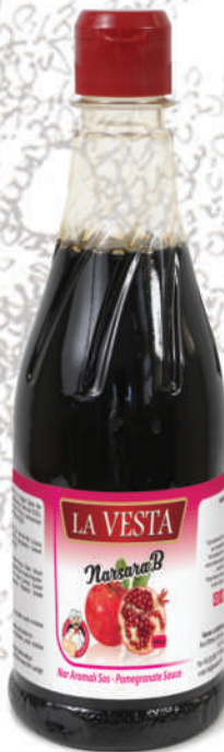
POMEGRANATE SAUCE (PLASTIC BOTTLE)