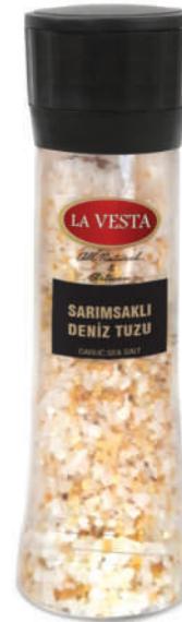
GARLIC SEA SALT