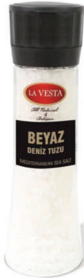
MEDITERRANEAN SEA SALT