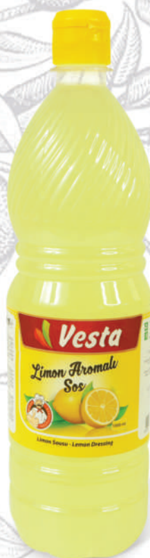
LEMON SOUCE (PLASTIC BOTTLE)